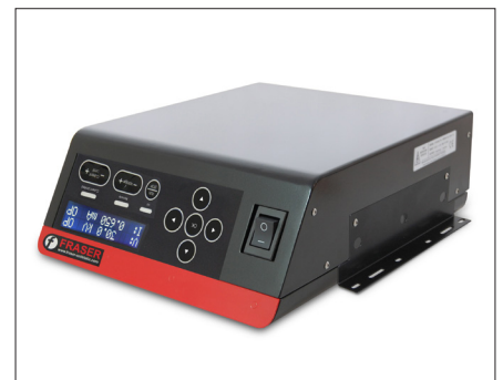
The display and keypad can be rotated by 180° for wall mounting. Please specify 'inverted display' on purchase orders.