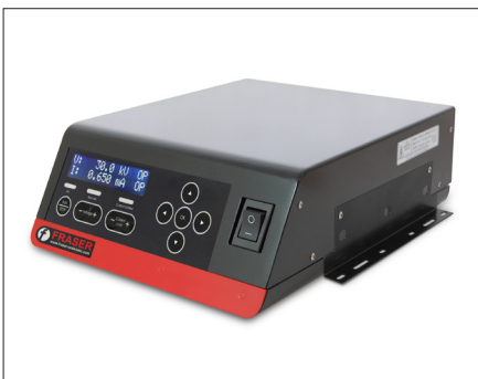
Standard 'bench top' fixing bracket position.

The IONFIX range has been designed for ease of use with brackets for flexible mounting.