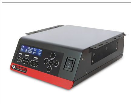
The brackets can be fitted to allow for 'under bench' mounting.